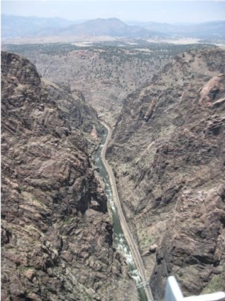
A Long Way Down

Royal Gorge is another popular destination. It is a little over an hour ride Southeast of Colorado Springs. Everything in this facility except the bridge itself burnt up in a forest fire back in 2013 and has been re-built. It is really nice. You can take an aerial tram over the gorge or, for those that are more adventurous, you can zip line across the gorge. We choose the aerial tram option and walked back across the bridge. The very odd thing to me about this bridge as that it never really did go anywhere. They just decided to build a bridge across the gorge.