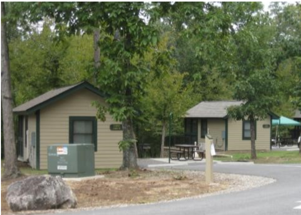
Or More Modest Cabins

The park is also the site of Three Sisters Springs which apparently was a big attraction in the late 1800's / early 1900's for their reported healing powers. Unlike the springs at Hot Springs, these are actually cold water springs. The springs themselves are not overly impressive but it is sort of interesting.