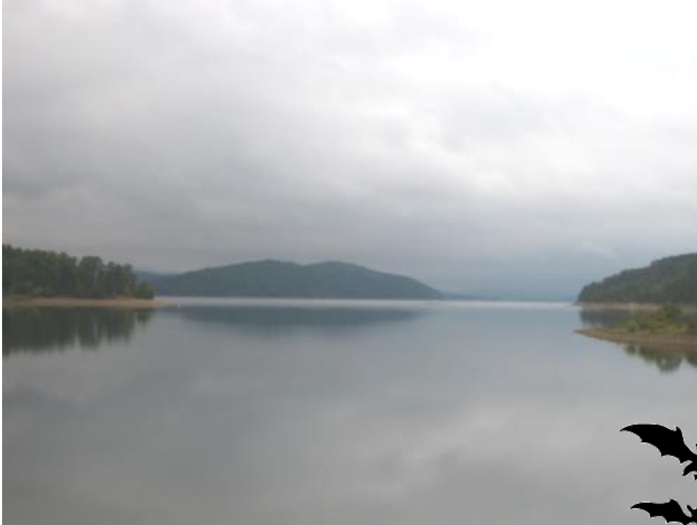
Lake Ouachita is a Big Lake!