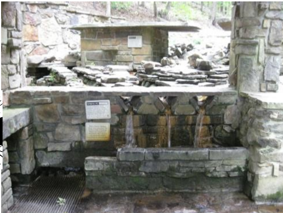
Three Sisters Springs