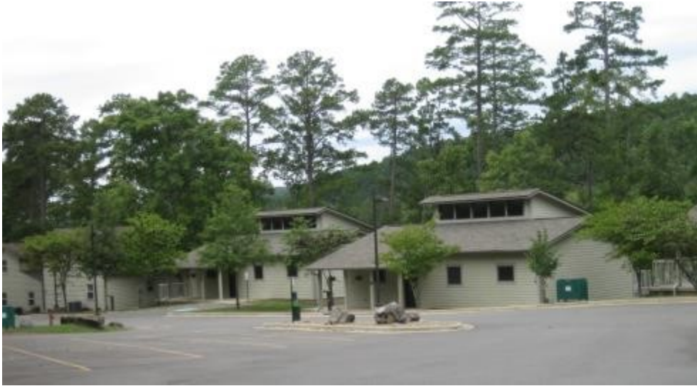
Very Nice Looking Cottages Available

The state park has really nice asphalt RV camping spots most of which are pretty level with graveled picnic areas. They also have some really nice looking cottages and cabins available. At least they look nice from the outside! Plenty of tent camping is also available in the park.