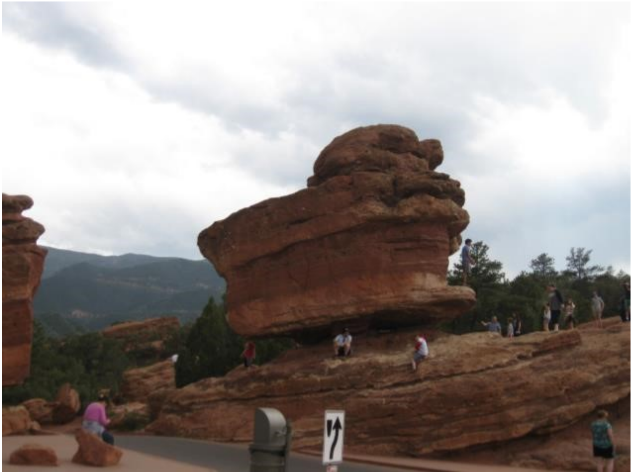
The "Balanced Rock" at Garden of the Gods

So, that is your short but sweet travel report for 2018. If you have not visited either of these two destinations, might be worth a look.