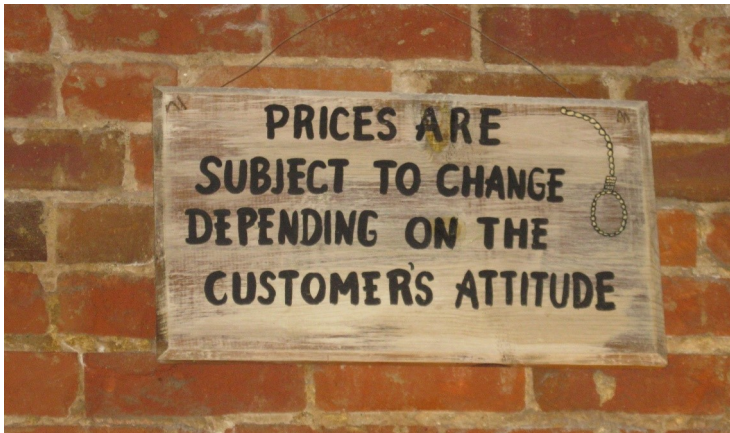
They Must Have Erected This Sign After M2's Last Visit a Few Years Back